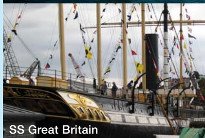
SS Great Britain

5 days from £599 Departing 29th April 2024