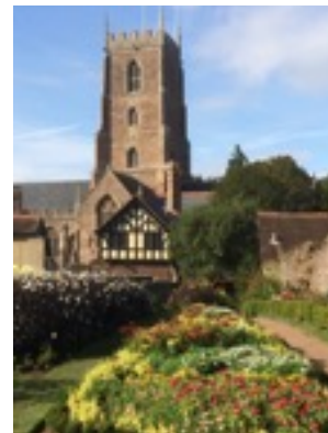
NT Garden and church