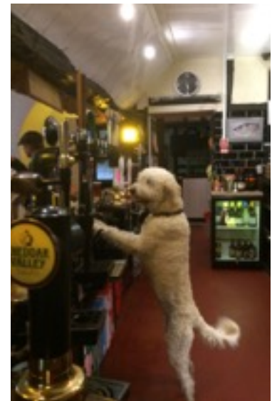
Dunster: The Yarn Market, High Street, a friendly local pub.